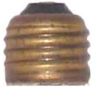
Modern Edison Screw Base