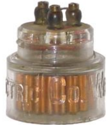
Westinghouse Factory Lamp