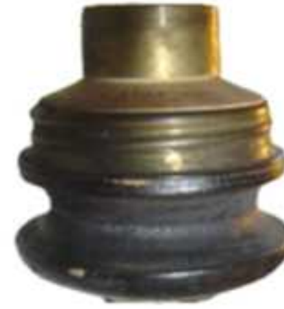
Edison Wooden Base