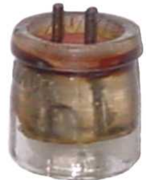
Westinghouse Double-pin Stopper Bulb