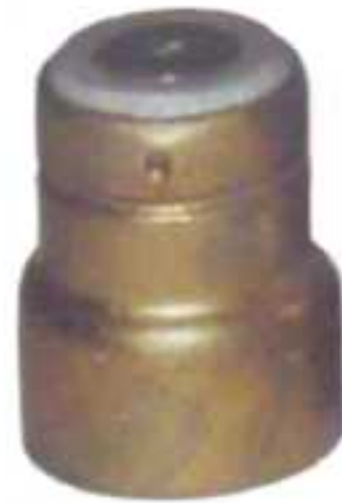
Ediswan (Bayonet) Base Single Contact