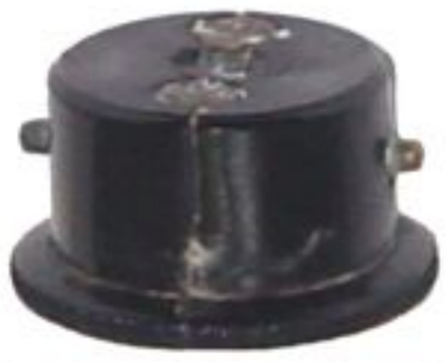
Vitrite & Luminoid