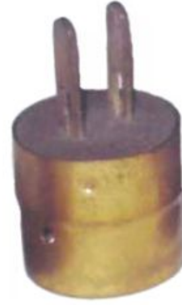
Fort Wayne Jenny