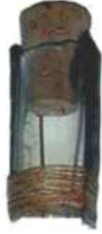
1879 Edison Metal Strip & Wire Terminal Base