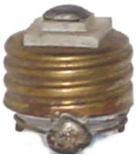
Miller Patent Base