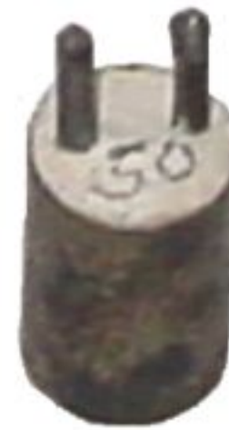
Siemens & Halske