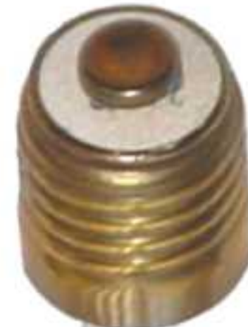
Edison Long Screw Base with Porcelain Insulator