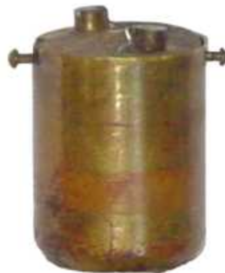
Brush-Swan (Pins 45° to contacts)