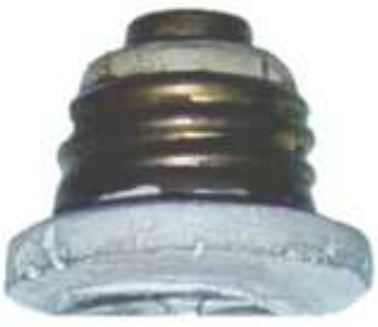
Edison Short Plaster Screw Base with collar