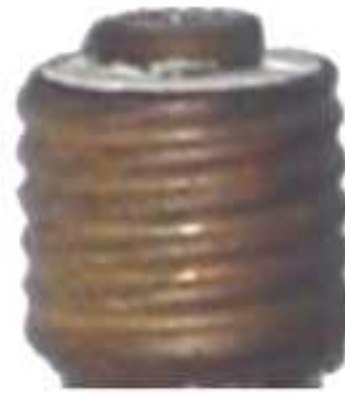
Edison Long Plaster Screw Base