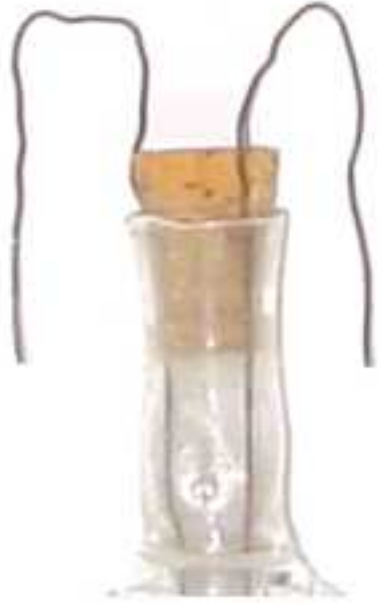
Edison Wire Terminal Base