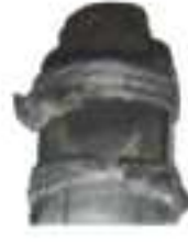
1880 Edison Metal Strip & Wire Terminal Base