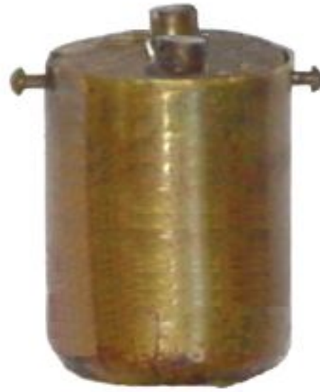
Hawkeye (Pins 90° to contacts)