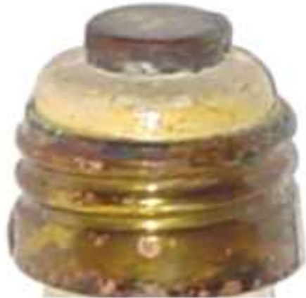
Edison Short Plaster Screw Base