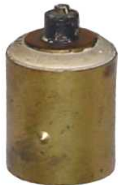
United States Base