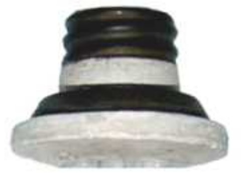
Johnson Bevel Ring Base (Edison)