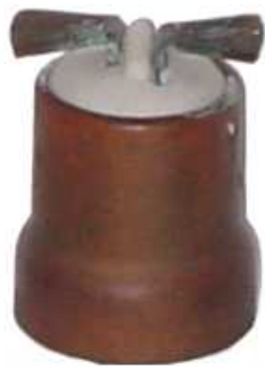
Siemens & Halske