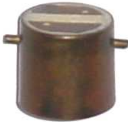
Ediswan (Bayonet) Base Double Contact