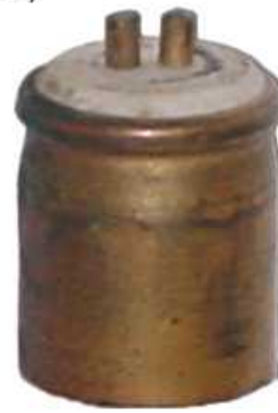
Westinghouse Double-pin Non-Stopper Bulb